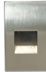
NSW-730BN Brushed Nickel