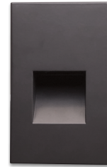
NSW-730DBZ Deep Bronze