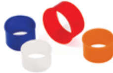
Translucent Decorative Collar