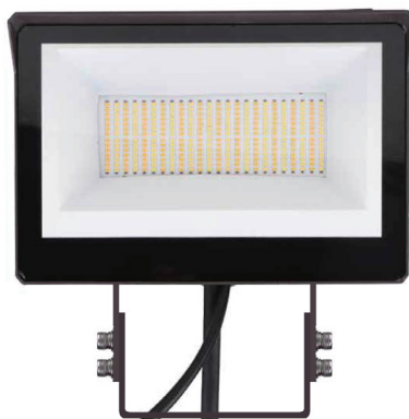
Trunnion Mount Included