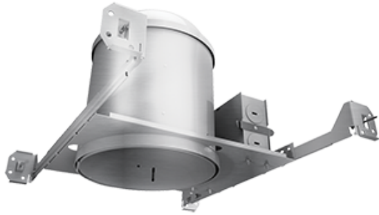
Weight: 2.1 lbs